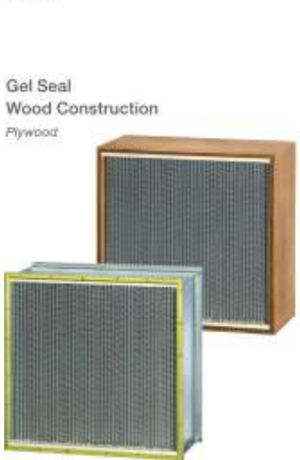
Gel Seal Wood Construction Plywood