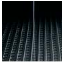
Scan test showing leak indicated by a smoke trail.

For pharmaceutical and those applications requiring PAO, AAF Flanders offers scanning with this material using a light scattering photometer.