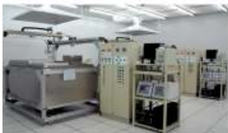
AAF Flanders laser spectrometer.

Laser Test – The filter is tested with a laser spectrometer using polystyrene latex (PSL) spheres. Filter efficiency is determined by comparing the upstream and downstream concentrations. Efficiencies down to 0.10 micrometers can be determined.