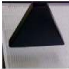
Scanning with light scattering photometer.